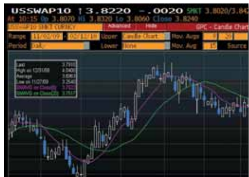
SwapMarker historical data and technical analysis via Bloomberg Professional®

ONE OF THE MOST WIDELY USED REAL-TIME PRICE REFERENCES FOR GLOBAL INTEREST RATE DERIVATIVES AND CURRENCY SWAPS. SWAPMARKER PROVIDES THE PREMIUM REAL-TIME CAPITAL MARKETS DATA FROM TULLETT PREBON'S AWARD WINNING BROKING DESKS. SWAPMARKER IS THE ORIGINAL SWAP PRICING SERVICE – IT HAS BEEN THE BENCHMARK FOR OVER 15 YEARS.